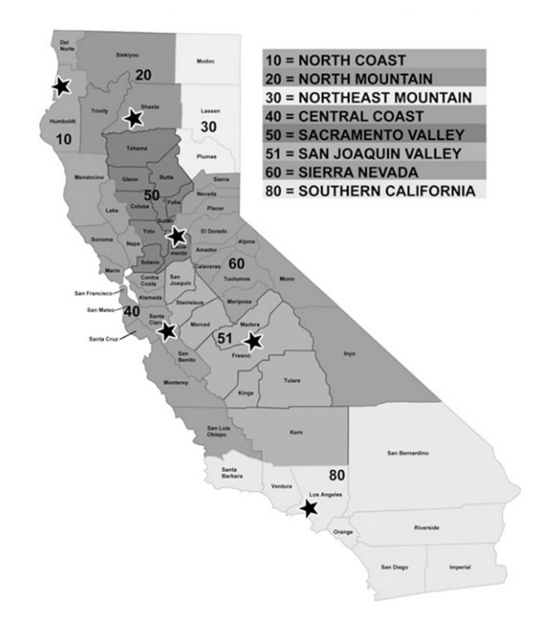
Figure 2. California agricultural districts and location of selected newspapers. The locations of newspapers selected for this study are denoted with stars.